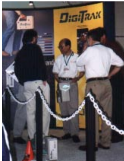
Senior DCI engineers demonstrate Eclipse system at ICUEE 99.