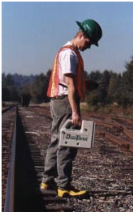
The DigiTrak Mark IV Receiver looks the same as previous versions—the differences are in the display and in the software.