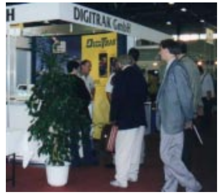
Our booth in Budapest generated a good deal of interest.

The FASTRAK newsletter is published quarterly by Digital Control Incorporated, 425 S.W. 41st Street, Renton, WA 98055, USA. Phone 425-251-0559, Fax 425-251-0702, E-mail dci@digital-control.com . We welcome comments and letters to the editor via mail, fax, or e-mail. Please contact us if you are interested in more information or would like to be added to our mailing list. FasTrak, DigiTrak, DataLog, Eclipse, SuperCell, DigiTrak LT, and the DCI logo are trademarks of Digital Control Incorporated.