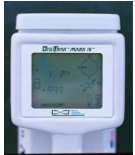
The DigiTrak Mark IV graphic display provides simple intuitive graphics and menu-driven commands.

Other Mark IV features include the capability to view depth measure-